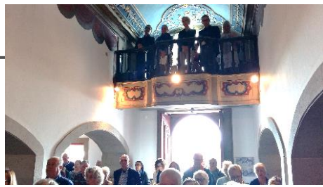
Penha França Chapel's Choir Gallery

Facebook: www.facebook.com/penhafrancachapel