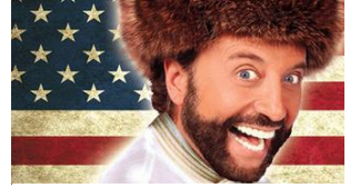
Comedian Yakov Smirnoff

When Comedian Yakov Smirnoff first came to the United States from Russia he was not prepared for the incredible variety of instant products available in American grocery stores. He says: « On my first shopping trip, I saw powdered milk; you just add water, and you get milk. Then I saw powdered orange juice; you just add water, and you get orange juice. And then I saw baby powder, and I thought to myself, 'What a country!' »