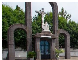
Santa Teresinha Monument

In Madeira during Lent and Easter time, we have a tradition where different parishes around the island have processions of the Stations of the Cross . Along one road in the town of Canhas there are large stone crosses that mark the fourteen stations of the Via Crucis . Today there will be a procession, starting at the churches of Canhas and Carvalhal passing through all the stations, and finishing at the monument Santa Teresinha at 18h00 with a Eucharistic Mass. This tradition (the procession) is a spiritual exercise that helps to relive the passion and death of Christ.