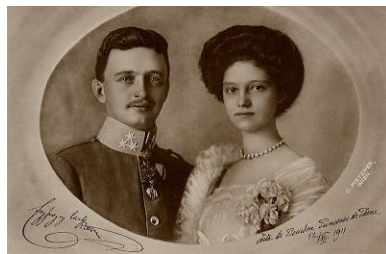
Blessed Karl and his wife, Zita

His body is buried here on the island of Madeira, in the church of Nossa Senhora do Monte . Karl of the House of Austria was born on August 17, 1887. On October 21, 1911, he married Zita of Bourbon-Parma. With his wife and children, he led an exemplary family life - a true domestic church, shaped by his intimate love for the Blessed Sacrament and devotion to the Blessed Virgin Mary. In 1916, in the midst of the First World War he became Emperor of Austria and was crowned King of Hungary. After the revolution of the Provisional National Assembly in 1919, he was banished into exile, lived in poverty and bore his illness with a profound trust in God. He died on April 1, 1922, in Funchal on the island of Madeira, while calling upon the name of Jesus.