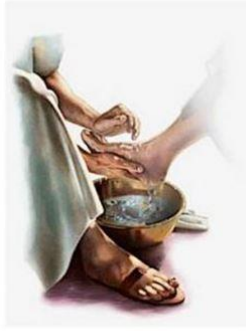
"You should wash each other's feet" (John 13:14).

We would like to be able to thank everyone who contributes with a donation towards People Helping People , unfortunately bank donations often appear with no identification. Please send us a short e-mail letting us know if you make any bank transfer / deposit, so that we are able to acknowledge your gift.