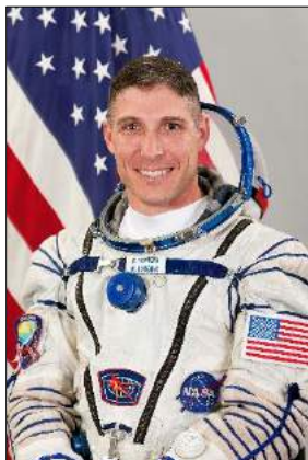
Astronaut Mike Hopkins

Astronaut Mike Hopkins is one of those selected few. He spent six months on the International Space Station (ISS) in 2013 . And though he was thrilled when he was chosen for a space mission, there was one Person he didn't want to leave behind: Jesus in the Eucharist. Hopkins had been received into the Church less than a year before his launch. After a long wait, he was finally able to receive Our Lord at each Mass. Facing the prospect of being off the planet for half a year, he decided he had to find out if Jesus could travel with him. It turns out he could - and he did.