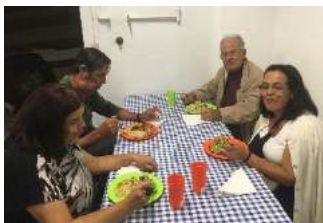
Eating with the homeless.