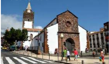
The Sé Cathedral

In Chapel of Penha de França we are still working on a way to make it possible for you to light some candles for your loved ones, but in the mean-time here is our suggestion: the Sé Cathedral in the centre of Funchal.