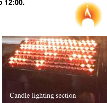
Candle lighting section