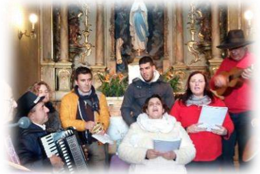
The family choir group “ALEGRACAMPO” singing here at our Chapel last year in December.

Nine days before Christmas (starting on December 16 th ), these traditional «Child Birth Masses» are celebrated in every Parish around the Island very early in the morning, usually between 5am and 6am! These Masses are held every morning for 9 days. Traditional Christmas hymns are sung, and after Mass there is a social outside the church with different goodies to eat and share, different musical instruments playing and people singing and socializing.