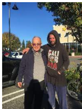
I found God by surprise

JESUS IS A REFUGEE: Thousands of people are, today, fleeing from their homelands because others want to destroy them.