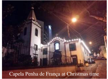
Capela Penha de França at Christmas time