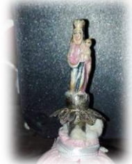
image of the Virgin Mary in the world. In fact, local authorities proposed that the tiny sculpture be noted in the Guinness Book of World Records.

A chapel in the city of Viacha (in Bolivia), is responsible for housing the Virgin of the Litanies . This is quite a special image - not only because visiting it involves a trip to a city 4,200 meters above sea level, but also because the image itself is only 4.7 cm tall, making it a contender for the smallest