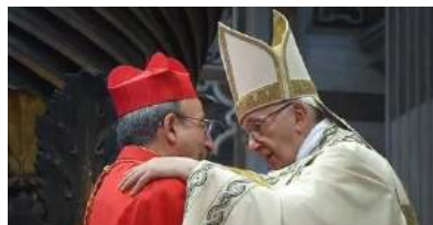
During the June 28th ceremony: Cardinal Antônio Marto from Portugal