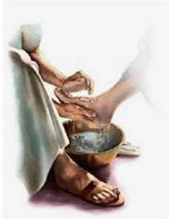
"You should wash each other's feet" (John 13:14).