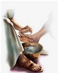
"You should wash each other's feet" (John 13:14).