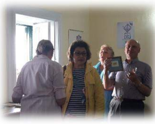
The auction under way!