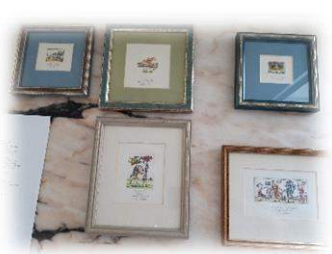
The 5 paintings