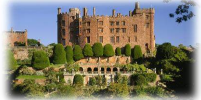
Powis Castle in Wales

Every time I saw one of those signs I thought «I wish I could go around the world and put a sign in every person, especially in the poor, in the homeless, in every child and in every unborn child, in every elderly person, in every saint and in every criminal, in every nun and in every prostitute, every farmer and in every politician, in every prisoner no matter the cause of his imprisonment, in every race, colour and religion, in every insignificant human being but with the opposite message: «If you want to preserve me please touch me».