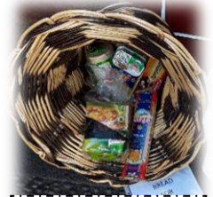
Food Basket at the Chapel Door

Besides feeding the poor, People Helping People also tries to help in other difficult situations too. For example: