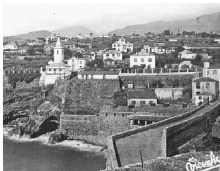
Photo of the Chapel from the 1800s, showing the peak on which it was built.

Because it's Christmas we decided to write a little bit about the history of the Chapel.