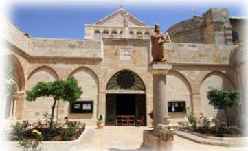
Church of the Nativity in Bethlehem