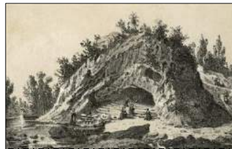
Rocher de Massabielle at Lourdes

"Everything that I have accomplished I owe to Our Lady of Lourdes, to Mary. I have always placed myself in her hands and I thank her. I pray to her every morning and this gives me strength. Without her we can do little."