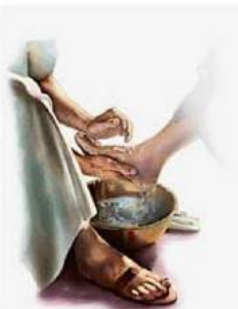
"You should wash each other's feet" (John 13:14).

The Mission Statement of People Helping People is... through social solidarity, to mobilize many people to help many people in a combat against poverty, hunger, illness, exclusion, indifference, intolerance, and social injustice, with a special preference for the last, the least and the lost, having as a model the person of Jesus, the «Good Shepherd» (Gospel according to Luke, chapter 15). Our wish is that it may always be an open door when all the other doors close, building in this way, different feelings and acts of Mercy (Gospel according to Luke, chapter 6 and Matthew chapter 25).