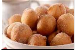
"Malassadas" with sugar