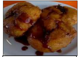
"Sonhos" with honey

The main attraction of the Carnival season on the island is last night's colourful and vibrant Carnival Float Parade which took place in the centre of Funchal. On Shrove Tuesday, 5 th of March, at 16h00 , there will be another parade, this time a Slapstick Parade (known locally as "O Cortejo Trapalhão") . Many participant's creativity knows no boundaries and spans from social and political satire, to traditional themes, or simple character disguise.