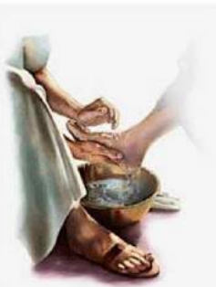
"You should wash each other's feet" (John 13:14).

The Mission Statement of People Helping People is... through social solidarity, to mobilize many people to help many people in a combat against poverty, hunger, illness, exclusion, indifference, intolerance, and social injustice, with a special preference for the last, the least and the lost, having as a model the person of Jesus, the «Good Shepherd» (Gospel according to Luke, chapter 15). Our wish is that it may always be an open door when all the other doors close, building in this way, different feelings and acts of Mercy (Gospel according to Luke, chapter 6 and Matthew chapter 25).