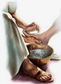
"You should wash each other's feet" (John 13:14).

The Mission Statement of People Helping People is... through social solidarity, to mobilize many people to help many people in a combat against poverty, hunger, illness, exclusion, indifference, intolerance, and social injustice, with a special preference for the last, the least and the lost, having as a model the person of Jesus, the «Good Shepherd» (Gospel according to Luke, chapter 15). Our wish is that it may always be an open door when all the other doors close, building in this way, different feelings and acts of Mercy (Gospel according to Luke, chapter 6 and Matthew chapter 25).