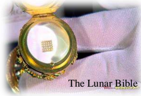
The Lunar Bible

The Lunar Bible began on a tragic note on January 27th, 1967. During a launch-pad test, a flash fire broke out and 3 astronauts were killed. Before his death, lunar module pilot, Ed White, said to a reporter that he hoped someday to take a Bible to the moon. To honour the astronaut's memory, a series of events took place over many years until White's dream was finally realized in 1971 when astronaut Edgar Mitchell took the Lunar Bible to the moon.