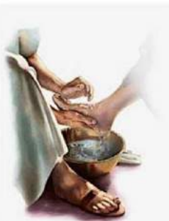
"You should wash each other's feet" (John 13:14).

The Mission Statement of People Helping People is... through social solidarity, to mobilize many people to help many people in a combat against poverty, hunger, illness, exclusion, indifference, intolerance, and social injustice, with a special preference for the last, the least and the lost, having as a model the person of Jesus, the «Good Shepherd» (Gospel according to Luke, chapter 15). Our wish is that it may always be an open door when all the other doors close, building in this way, different feelings and acts of Mercy (Gospel according to Luke, chapter 6 and Matthew chapter 25).