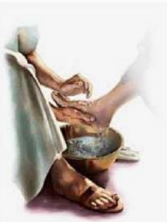
"You should wash each other's feet" (John 13:14).

The Mission Statement of People Helping People is... through social solidarity, to mobilize many people to help many people in a combat against poverty, hunger, illness, exclusion, indifference, intolerance, and social injustice, with a special preference for the last, the least and the lost, having as a model the person of Jesus, the «Good Shepherd» (Gospel according to Luke, chapter 15). Our wish is that it may always be an open door when all the other doors close, building in this way, different feelings and acts of Mercy (Gospel according to Luke, chapter 6 and Matthew chapter 25).