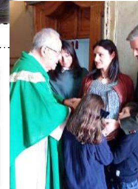
Special blessing of a soon-to-be-born baby