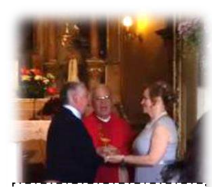
Renewal of Wedding vows of a special couple