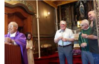
Giving flowers on Father's Day: to the oldest, the youngest, and the father with the most children who were at Mass that Sunday morning!