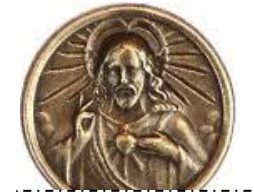
Sacred Heart badge

She died in Richfield Ohio, at age 77, on April 1, 1966. There were reportedly about 3,000 people present at the funeral, including AA’s co-founder, Bill W.