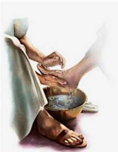
"You should wash each other's feet" (John 13:14).