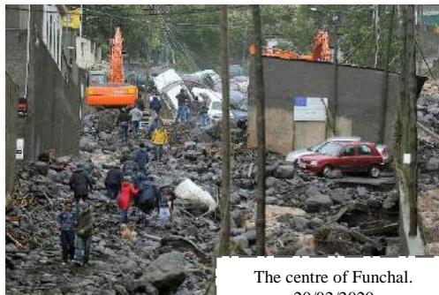
The centre of Funchal. 20/02/2020

My heart rejoices with gratitude for the generosity of so many tourists who leave Madeira Island know that because of them the poor become less poor, and because of them there is less suffering in this piece of land called the Pearl of the Atlantic.