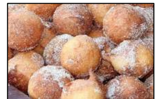
"Malassadas" with sugar