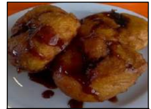
"Sonhos" with honey

On Shrove Tuesday, 25th of February, at 16h00, there will be another parade, this time a Slapstick Parade (known locally as "O Cortejo Trapalhão"). The parade is open to all, both locals and foreign citizens, either independently or as a group. Many participant's creativity knows no boundaries and spans from social and political satire, to traditional themes, or simple character disguise.