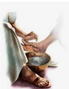
"You should wash each other's feet" (John 13:14).