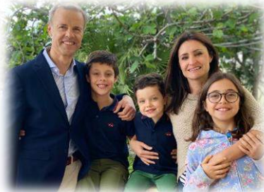
Manolito with his father, his little brother Pedro, his mother, and his sister Natalia