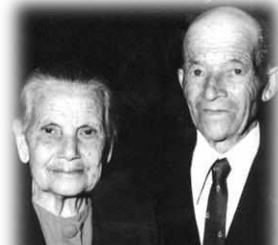
My mother and father