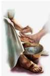
"You should wash each other's feet" (John 13:34)