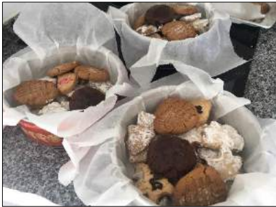
The home-made Christmas cookies