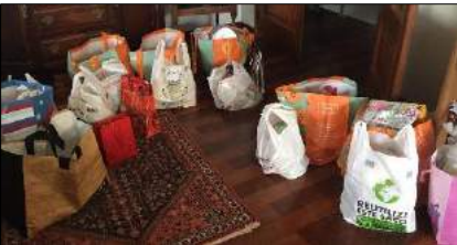
The seven hampers collected for needy families at the Chapel

Seven hampers were made up for needy families from the donations received in our Christmas Hamper Drive.