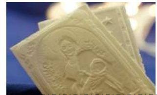
An oplatek with image of Mary and baby Jesus

After the breaking of the bread is completed, a small meal is served that eagerly anticipates the Midnight Mass, which many Polish families would attend on Christmas Eve. The tradition has survived the test of time and is still celebrated in many parts of the world. It is a beautiful tradition, one that keeps the true "spirit of Christmas," and unites a family to celebrate the birth of Jesus Christ.