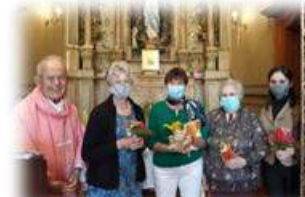
Our lovely mothers with their flowers