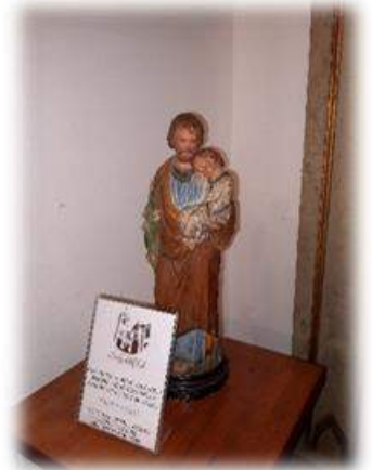
Statue of St. Joseph in our Chapel