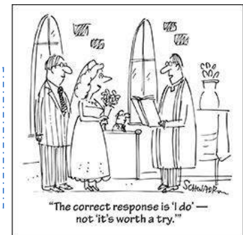
"The correct response is 'I do' — not 'it's worth a try.'"