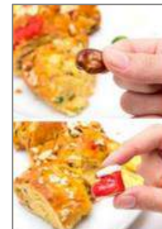
A “fava” (broad) bean, and a figurine hidden in the Bolo Rei cake

“Bolo Rei” (English: “King Cake”) is a traditional Portuguese cake that is usually eaten around Christmas, from December 25 th until Epiphany, on the 6 th January. The cake itself is round with a large hole in the centre, resembling a crown covered with crystallized and dried fruit. It is baked from a soft, white dough, and in some of these cakes there is the characteristic dried “fava” (broad) bean or small Wise Man figurine. Tradition dictates that whoever finds the fava bean or the Wise Man figurine, must pay for next year’s cake!