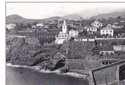
Photo of the Chapel from the 1800s, showing the peak on which it was built.