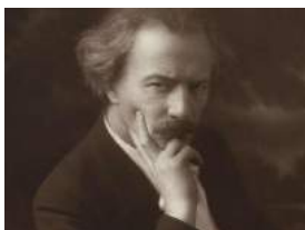
Ignacy Jan Paderewski, 1920