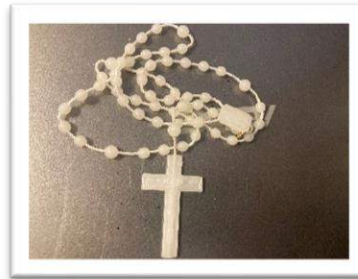
My priceless gift from a homeless brother