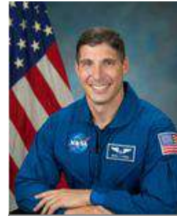
Astronaut Mike Hopkins

Source: https://cnstopstories.com/2016/04/07/for-catholic-astronauts-flying-to-space-doesnt-mean-giving-up-the-faith/