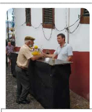
Traditional Beverages counter