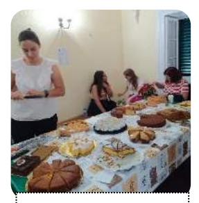
Coffee and Cakes in the social room