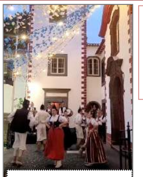
Traditional Folk dancing