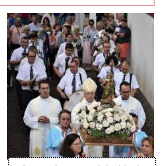
Procession around the block surrounding the Chapel