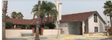
St. Anthony's Church in Oakley

November 11, 2002 will leave a deep mark in the history of St. Anthony's Church in Oakley. “Loaves and Fishes” inaugurated today is a program to serve free meals to the public. Today, November 11, 2002 free meals were served between 11:30 AM and 1:15 PM in our Parish Hall.