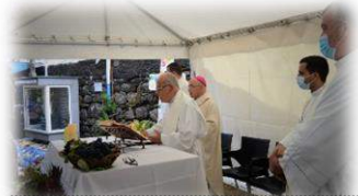
Sept. 12 th 2020 - Inauguration of the Little Corner of the Good Shepherd in Bica da Cana