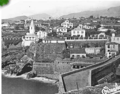
Photo of the Chapel from the 1800s, showing the peak on which it was built.

Many tourists and visitors who come here for Mass on Sunday mornings often ask about the history of the Chapel... so today we decided to write a little bit about it for those who would like to know a little bit more. This small chapel was founded by Antonio Dantas in 1622 (400 years ago!) It was originally built to minister to the soldiers of the small garrison at the Pontinha Redoubt ( stronghold ) in the bay of Funchal, but the Chapel soon became so famous a shrine that people came to it on pilgrimage from all parts of the Island. When the Diocese of Funchal took possession of the chapel it was used as the Bishop's Summer Residence for many years. In the meantime, the Franciscans had been coming to Madeira to carry out apostolic duties, and in 1935, they founded the Franciscan