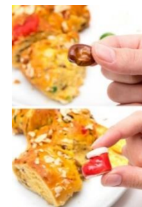
A "fava" (broad) bean, and a figurine hidden in the Bolo Rei cake

"Bolo Rei" ("King Cake") is a traditional Portuguese cake that is usually eaten around Christmas, from December 25th until Epiphany, on the 6th January. The cake itself is round with a large hole in the centre, resembling a crown covered with crystallized and dried fruit. It is baked from a soft, white dough, and in some of these