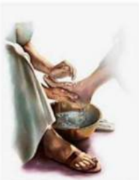
"You should wash each other's feet" (John 13:14).