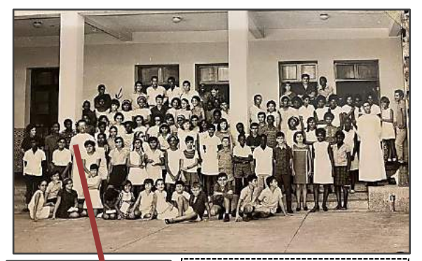
Quelimane, Mozambique after one of many retreats with the youth there

were working in different professions. Then students started joining them and pretty soon the group was a large group of different ages. Then the Juvenile Center started growing, up to the point of being able to mobilize the entire city of Quelimane , which is not a big city. There were always different activities happening and those activities created among them a sense of community.