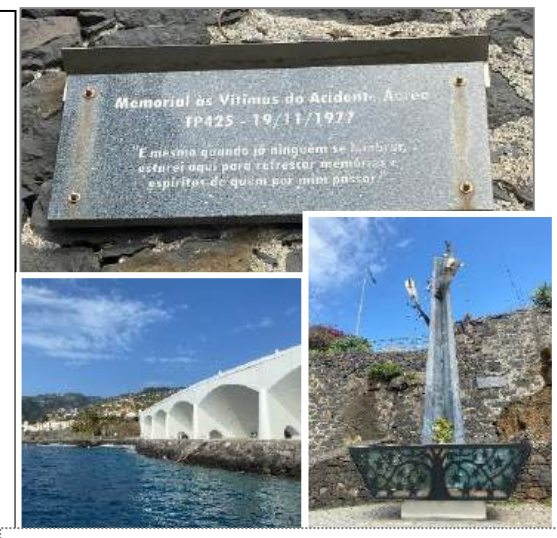
A MEMORIAL TO ALL 131 VICTIMS OF THE 1977 PLANE CRASH IS LOCATED IN SANTA CRUZ

All were on flight TAP 425, 727-200 (CS-TBR) which tragically crashed into the sea at Madeira's Santa Catarina Airport, Santa Cruz, on November 19, 1977.