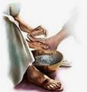
"You should wash each other's feet" (John 13:14).