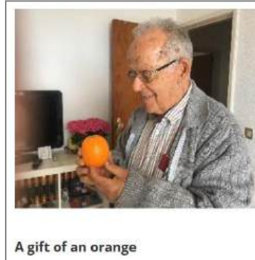
A gift of an orange

One Christmas day I got my first ever Christmas gift. It was an orange. It was so yellow and so beautiful that I didn't have the courage to eat it. When I was in California I told the story of this orange, the only Christmas gift of my childhood. A few days later I got a bag of oranges from a family. Since then, I always found a yellow orange on the top of the altar on the First Sunday of Advent and a box of oranges was delivered to my Parish residence on Christmas Eve. When I left California, 12 years ago, the same family gave me a plastic orange that I still treasure in my room. It is still yellow and beautiful and full of memories. – (June 2019)