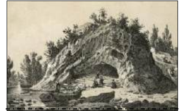
Rocher de Massabielle at Lourdes

"Everything that I have accomplished I owe to Our Lady of Lourdes, to Mary. I have always placed myself in her hands and I thank her. I pray to her every morning and this gives me strength. Without her we can do little."